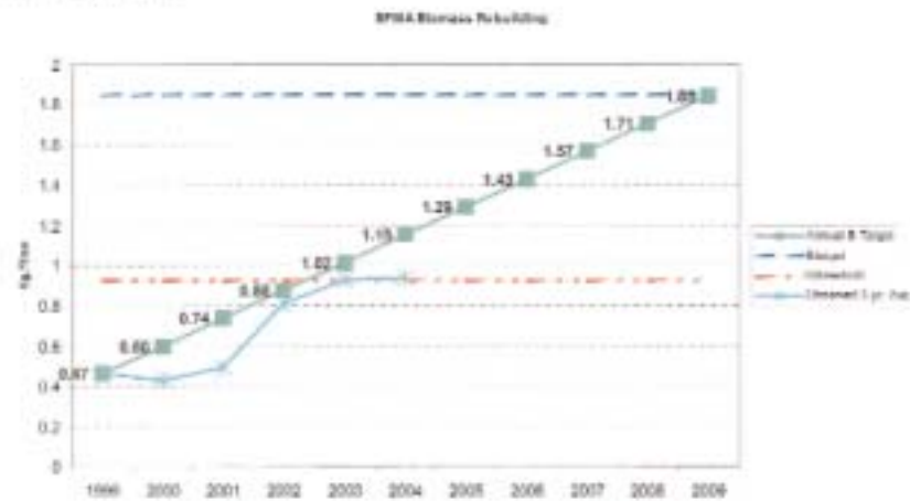
Figure 3 - SFMA biomass index (2004 three-year running average) relative to annual rebuilding targets.

Framework 2 of the monkfish plan, adopted in 2003, established a method for evaluating on an annual basis the rebuilding progress of the fishery. The method compares the three-year running average of the biomass index to annual biomass targets which are ten equal increments between the 1999 observed value and the 2009 target. The ratio of the observed to the annual target value is applied to the previous year's landings to set target TACs for the upcoming year.