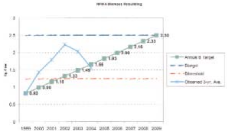
Figure 2 - NFMA biomass index (2004 three-year running average) relative to annual rebuilding targets.

"Monkfish have always been something fishermen could count on as far as price. With so much uncertainty out there, if we could find a way to target this species more effectively, it might help some get by during these difficult times," said Robillard.